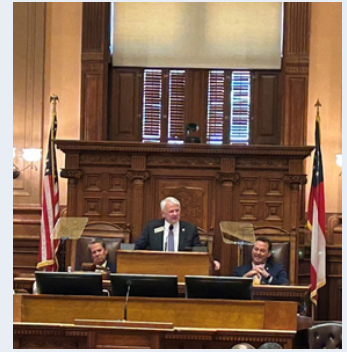
Governor Kemp SOS Address