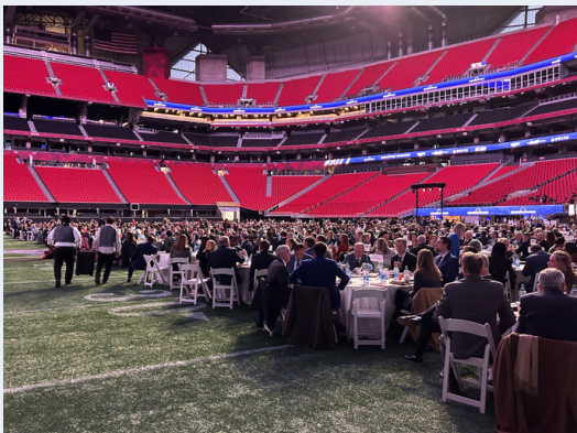
2024 Georgia Chamber Eggs and Issues