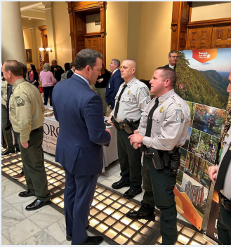
Keeping Georgia Wild