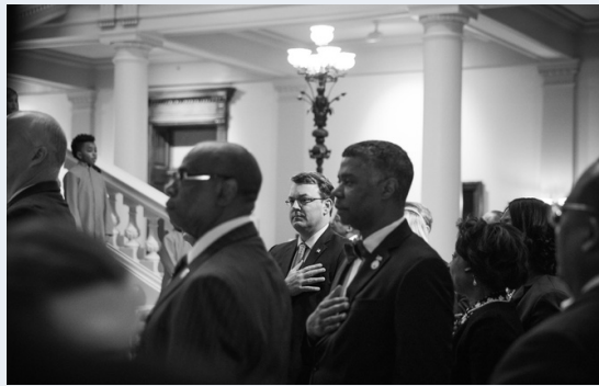
MLK Tribute Ceremony