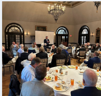
Atlanta Forum Luncheon