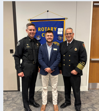
Canton Public Safety Appreciation Luncheon