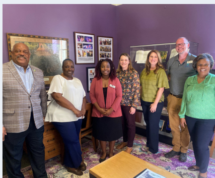
Alice Walker Mini-Museum