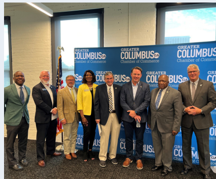
Columbus Chamber of Commerce