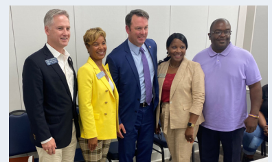
Fort Valley State University