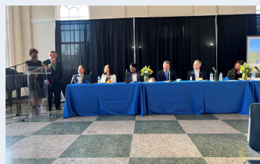
Albany State University