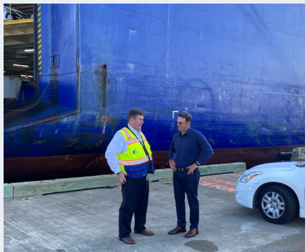
Port of Brunswick