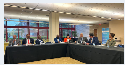
Atlanta University Center Consortium