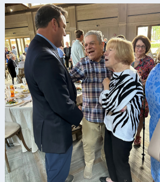
Greene County Chamber of Commerce