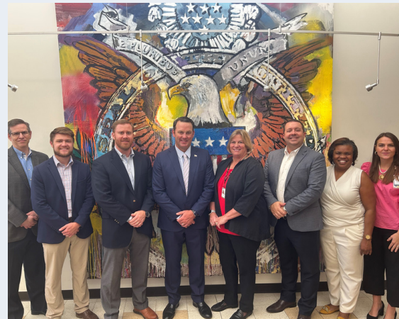
Shepherd Center Tour