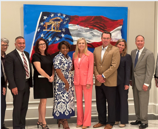
Members of the GRACE Commission