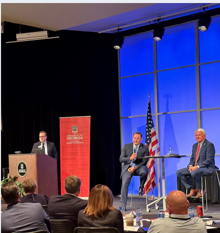
CVIQG Leadership Panel Athens, GA