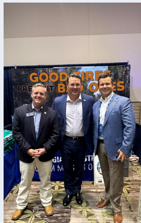
GA Forestry Jekyll Island, GA