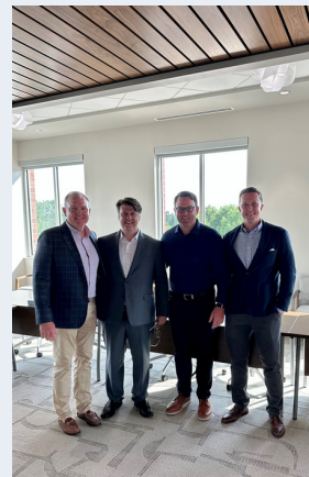
UCBC Athens, GA