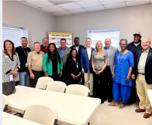
NAMI Meeting and Tour Warner Robins, GA