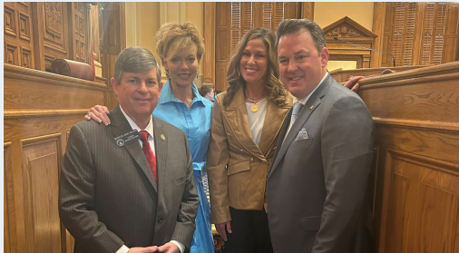
Senator Larry Walker was elected to serve as President Pro Tempore.

For additional information on the Senate Committee schedule, please follow this link: https://www.legis.ga.gov/schedule/senate . For information on legislation that has been introduced, please follow this link: https://www.legis.ga.gov/legislation/all .