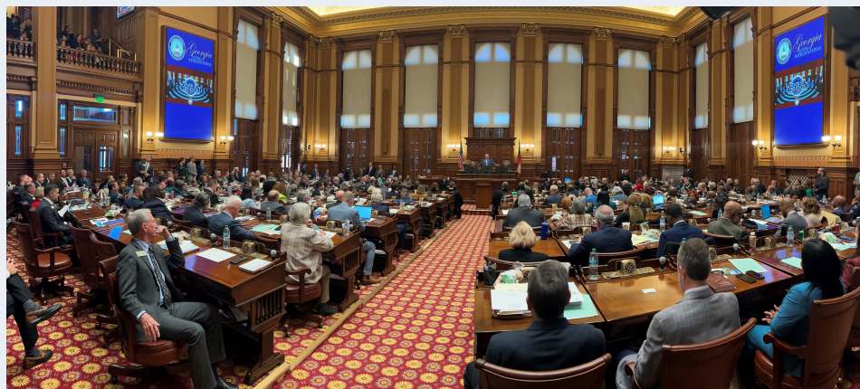
Governor Brian Kemp delivering the 2026 State of the State Address in the House Chamber.