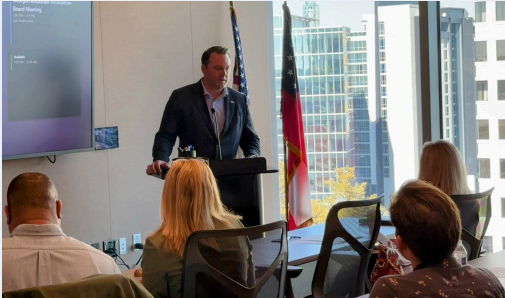
Lt. Governor Burt Jones meeting with the GA Restaurant Assoc. Board

Lt. Governor Burt Jones and staff members traveled around the state to meet with constituents, hear about their concerns, and also present proclamations to outstanding organizations and Georgia citizens who are making a difference from the north Georgia mountains to the coast.