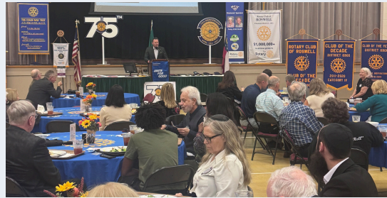
Lt. Governor Burt Jones meeting with constituents at the Roswell Rotary Club