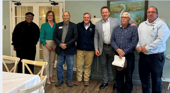
Lt. Governor Burt Jones meeting with Senator Russ Goodman and constituents in Blackshear