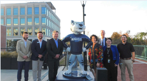
Lt. Governor Burt Jones meeting with staff, leaders and students at the GA Cyber Center