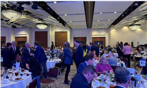
Lt. Governor Burt Jones attended the Georgia Congressional Luncheon 2025 with leaders and business owners from around Georgia