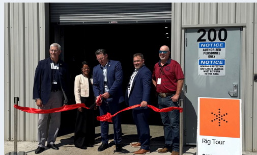
Lt. Governor Burt Jones attending the Block's Proto Ribbon Cutting Ceremony at Core Scientific's Dalton