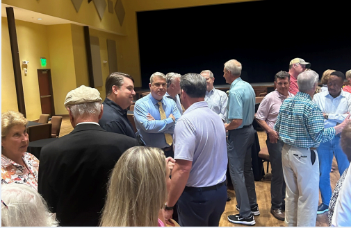
Lt. Governor Burt Jones meeting with constituents at a road naming ceremony in Greene County