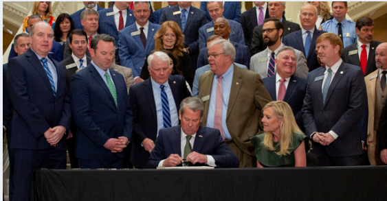
Amended Fiscal Year 2025 Budget

For information on Governor Kemp's disregard messages for the Fiscal Year 2026 Budget, please follow this link: https://gov.georgia.gov/executive-action/legislation/vetoed-legislation/2025