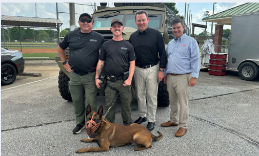
Public Safety/K-9 Training Visit Newnan