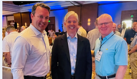
GA Highway Contractors Assoc. Convention