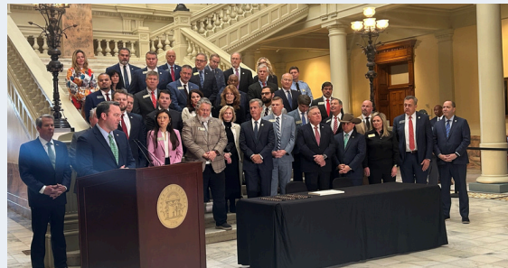
Fiscal Year 2026 Budget