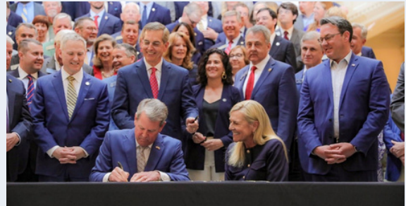
Senate Bills 68/69 Tort Reform