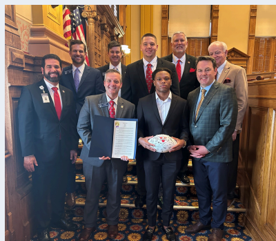
Valdosta State University Blazers Visiting the Senate Chamber