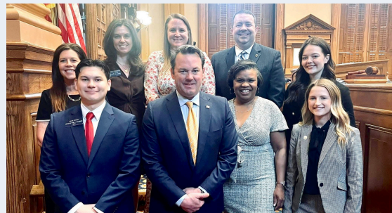
LG Office Staff and 2025 Legislative Session Interns