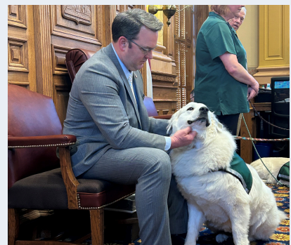
HOPE Animal Assisted Crisis Response Day in the Senate