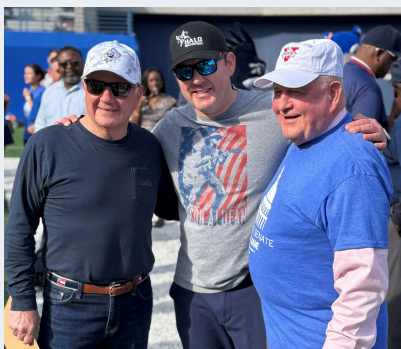
Annual Senate vs. House Kickball Game