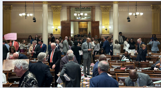
Sine Die 2025 - 4/4/2025