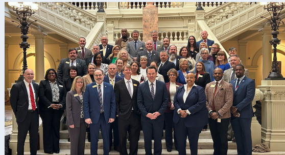
Probate Judges Day at the Capitol