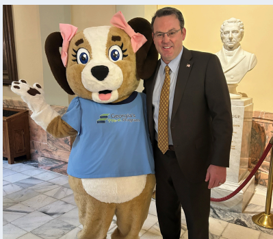
Celebrating Georgia Pre-K Week