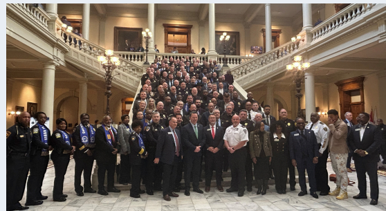
Chiefs of Police Day at the Capitol