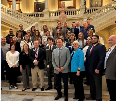
Catoosa and Walker Counties Day at the Capitol