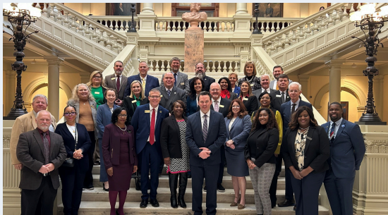
Magistrate Judges Day at the Capitol