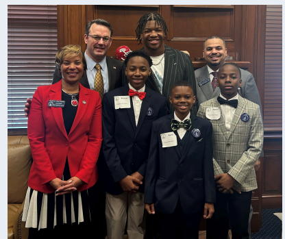
Nolan Smith visit with Senate Pages and Senator Sonya Halpern and Senator Derek Mallow