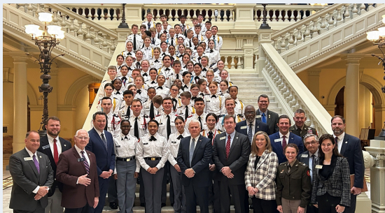
Georgia Military College Day at the Capitol