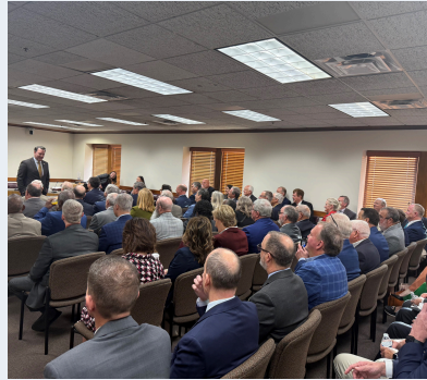
Meeting with Georgia Electric Membership Corp. (EMCs)