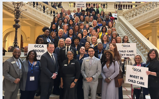
Georgia Child Care Association Day at the Capitol on February 12.

Under Senate Bill 89 , the current Georgia income tax credit for qualified child and dependent care expenses would be increased from the current 30 percent to 40 percent of the federal credit allowed under Section 21 of the federal tax code. A new Georgia Child Tax Credit, allowing taxpayers a credit of $250 per child under the age of seven, would be created. Additionally, Georgia’s employer-sponsored child care tax credit granted to an employer who sponsors or provides child care for employees, would be increased to equal 90% of the cost of operation to the employer (up from 75% under current law).