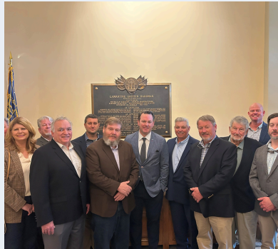
Meeting with Georgia Association of Groundwater Professionals