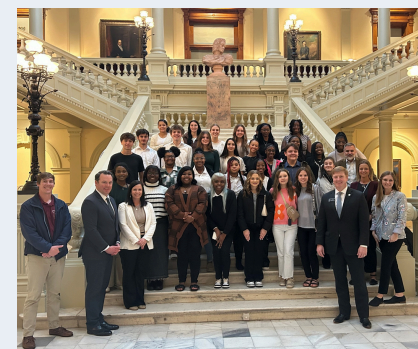
Meeting with Vidalia High School Students