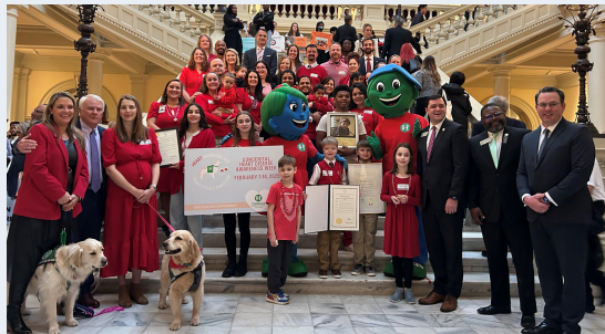
CHOA and Congenital Heart Defect Awareness Week