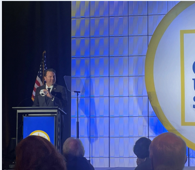
Legislative update at the GA Municipal Association Breakfast