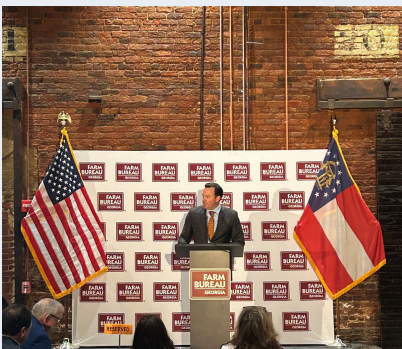
Attending the Georgia Farm Bureau Luncheon