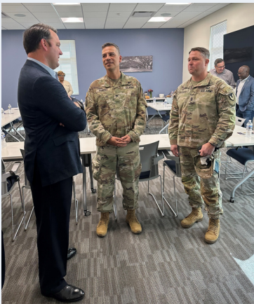
Cohen Clinic Tour