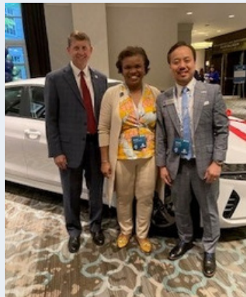
TCSG GOAL Awards