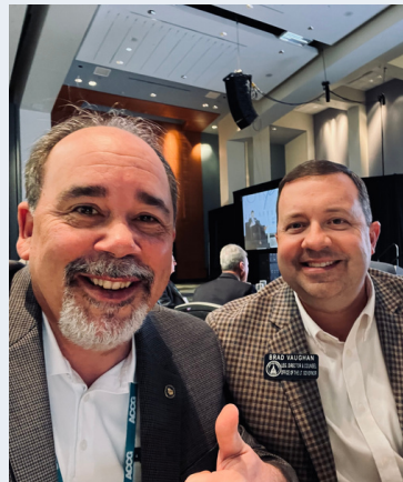
ACCG Annual Conference