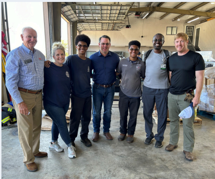
Lt. Governor Jones, Senator Max Burns, Senator Blake Tillery and EMA Volunteers in Hazlehurst, GA.

Please visit the Georgia Department of Agriculture Hurricane Response: Resource page for agriculture storm damage resources: https://agr.georgia.gov/hurricane-response-helene