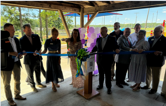
Lt. Governor Burt Jones joined local community leaders and representatives from CareSource.