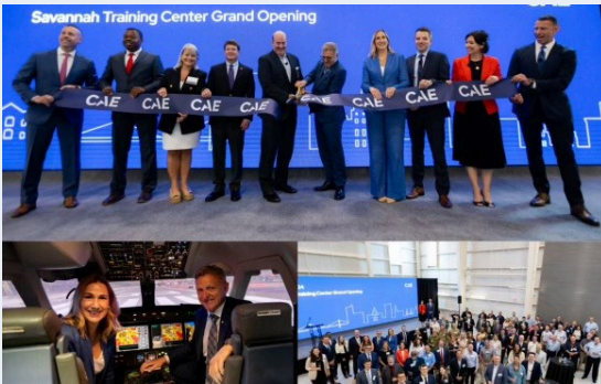
Tour and meeting with employees and staff at the Savannah CAE Training Center.