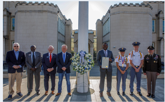
Proclamation honoring the National Peace Officers Memorial Ceremony at GMC in Milledgeville, GA.