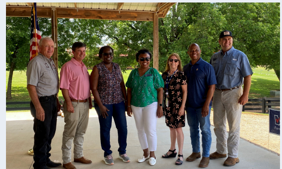
Southern Belle Farms in McDonough, GA for an event hosted by the Georgia Farm Bureau.