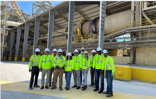
Tour and meeting with employees and staff at the Cemex facility in Warner Robins, GA.