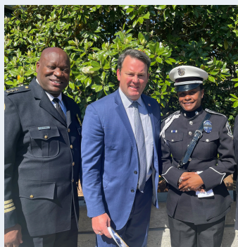
Public Safety Memorial Ceremony