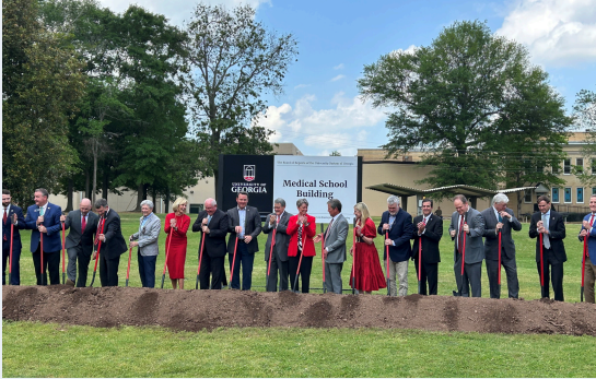
Groundbreaking Special Guests