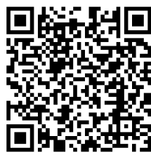
Governor Veto Statements

Governor Brian Kemp issued 12 veto statements . Please visit the website here or scan the QR code to review the veto statements.