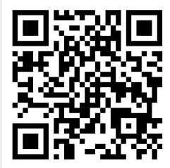
Lt. Governor 2024 Priorities

For a full list of bills signed by Governor Kemp, please visit the website here or scan the QR code.