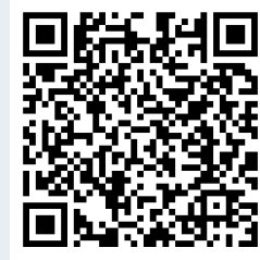
Governor Signed Bills

Governor Brian Kemp issued 12 veto statements . Please visit the website here or scan the QR code to review the veto statements.