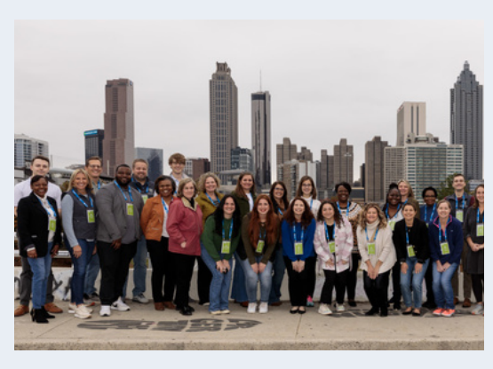
SAGE Class of 2023 Leadership Program